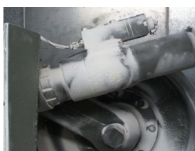
Sand & Dust