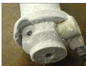
Cold temp -46C